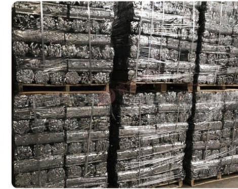
Marine grade raw materials