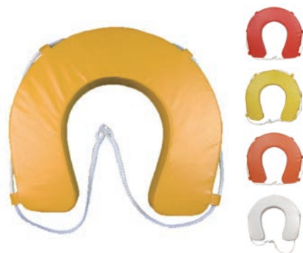
FLOATING U-SHAPED LIFE BUOY 浮动U型救生圈

Color: Orange Certificate: CE/CCS/MED Usage: Water Life Saving