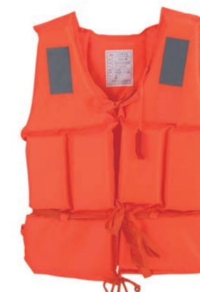
EPE LIFE JACKET EPE救生衣

Buoyancy > 75N CCS approval Suitable for yachts. Inflatable boat, motor boat, Sailing: Kayaking, etc. Trait Fabric strength is high, good protection performance, color does not fade Color: Red, orange, blue, fluorescent green Size :40 * 50 cm. Li :60 * 50 cm. Total :63 * 52 cm