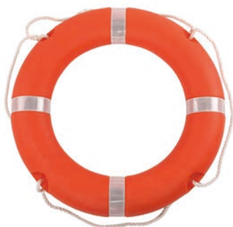
POLYETHYLENE MARINE LIFE RING 聚乙烯海洋救援圈