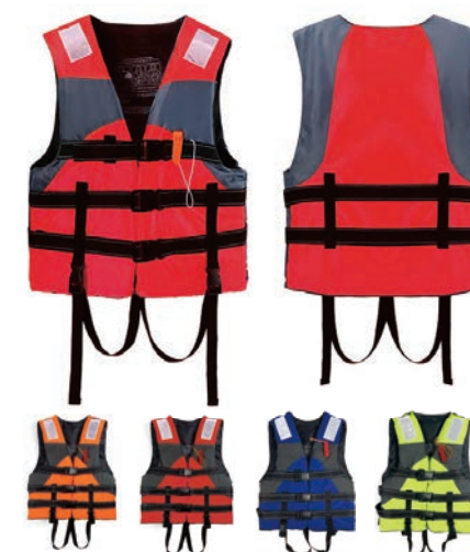
VEST LIFE JACKET 背心救生衣

Material: TUP nylon composite cloth Type: Automatic Buoyancy: 150N Color: Yellow, Red, Black, Blue, Rose, Orange