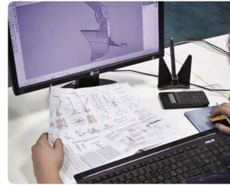
Design and development

Thank you in advance for your interest in working with ALASTIN!