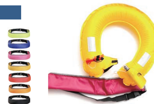
LARGE BUOYANCY INFLATABLE LIFE BUOY 大浮力充气式救生圈

Color: Red, White, Orange, Yellow Usage: Water Life Saving